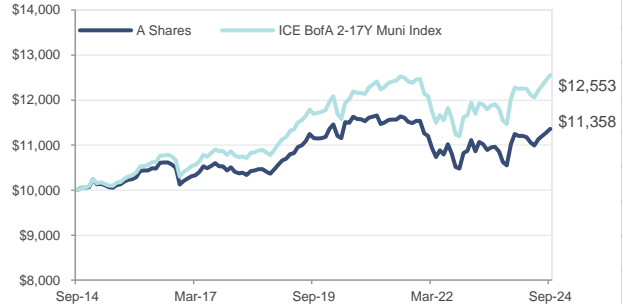
The Growth of $10,000 chart is hypothetical based upon the performance of A Shares without sales load for the period ended 09.30.2024. It includes the reinvestment of dividends and capital gains.