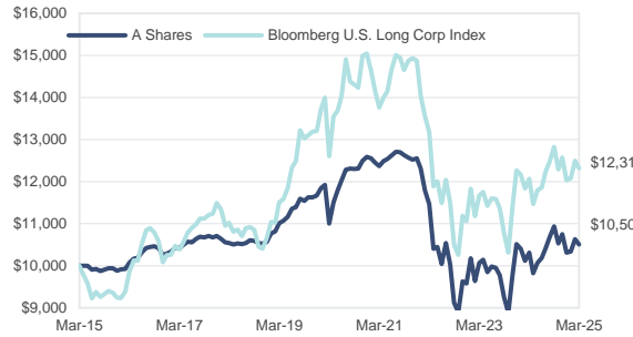
The Growth of $10,000 chart is hypothetical based upon the performance of A Shares without sales charge for the period ended 03.31.2025. It includes the reinvestment of dividends and capital gains.