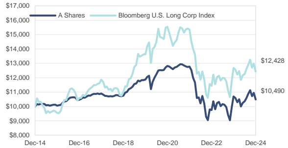
The Growth of $10,000 chart is hypothetical based upon the performance of A Shares without sales charge for the period ended 12.31.2024. It includes the reinvestment of dividends and capital gains.