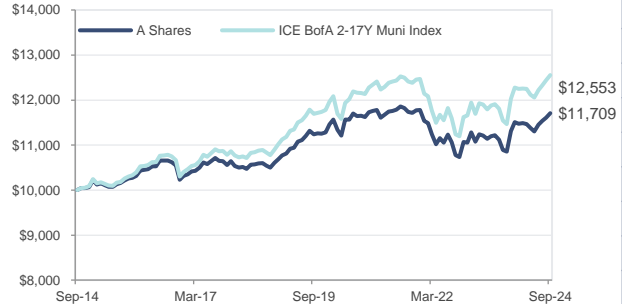
The Growth of $10,000 chart is hypothetical based upon the performance of A Shares without sales load for the period ended 09.30.2024. It includes the reinvestment of dividends and capital gains.